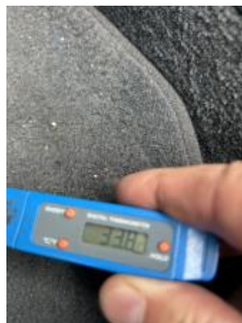
Temp Reading – Heaters on hot