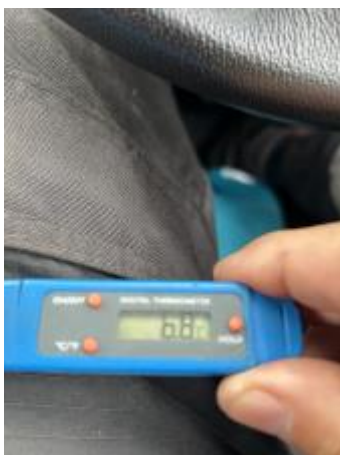
Temp Reading – Heaters on cold