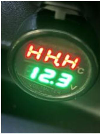
12V Battery Static