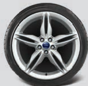
19" Alloy wheels - 235/45 R19 Only available with the Titanium Styling Pack