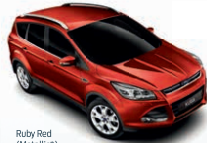
Ruby Red (Metallic*)