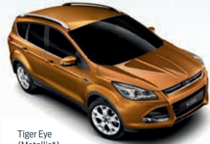
Tiger Eye (Metallic*)