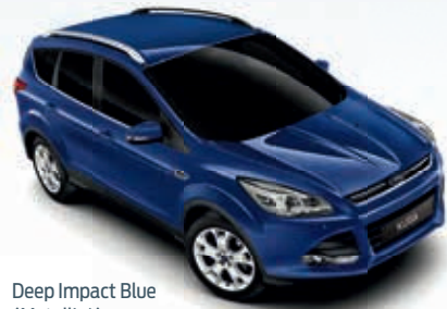
Deep Impact Blue (Metallic*)