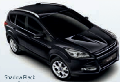
Shadow Black (Metallic*)