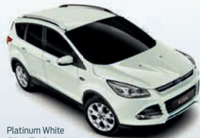
Platinum White (Metallic*)

*Metallic body colours are optional, at extra cost.