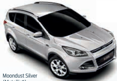
Moondust Silver (Metallic*)