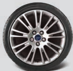
17" Alloy wheels - 235/55 R17 Standard on Trend