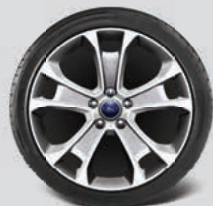
18" Alloy wheels - 235/50 R18 Standard on Titanium and available as an option on Trend