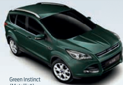
Green Instinct (Metallic*)