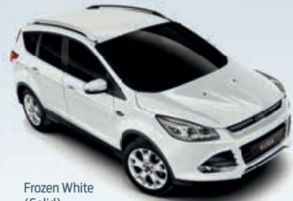
Frozen White (Solid)

Complementing the KUGA's stylish design, and satisfying your personal taste, is a range of attractive metallic and solid colours.