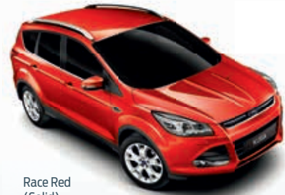
Race Red (Solid)