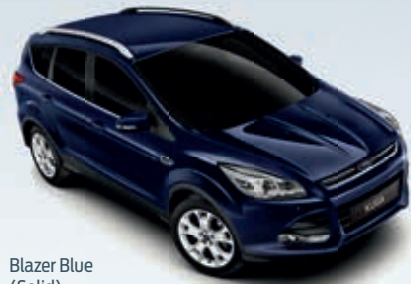
Blazer Blue (Solid)