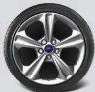
17" Alloy wheels - 235/55 R17 Standard on Ambiente