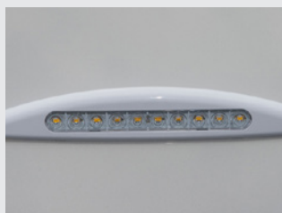
LED awning light