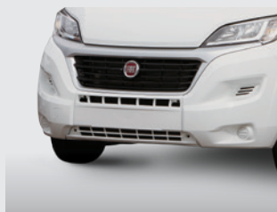
Fiat chassis 2.3L 150bhp 6-speed automatic Euro 5+ engine

All models are specified with driver and passenger airbags, cruise control, ABS braking, electronic stability, automatic lights and wipers, cab air-conditioning and reversing camera as standard.