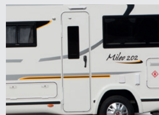
Habitation door on passenger side for improved safety