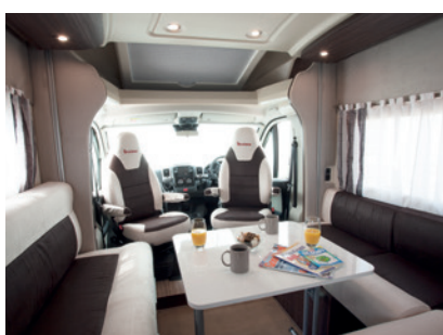
Mileo 286 Front Lounge