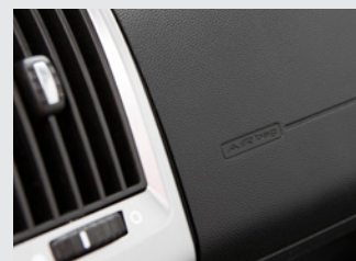
Passenger & driver airbags