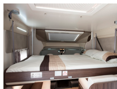
Mileo 202 Drop Down Bed

The details set out in this brochure were correct at the time of going to press, TrailLite are unable to guarantee that no changes in specification have subsequently taken place. TrailLite therefore reserve the right to alter the specifications and price at any time without prior notice. Please check with your Benimar consultant for more details.