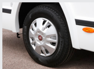
Electronic stability control