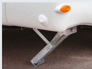
Rear corner steadies