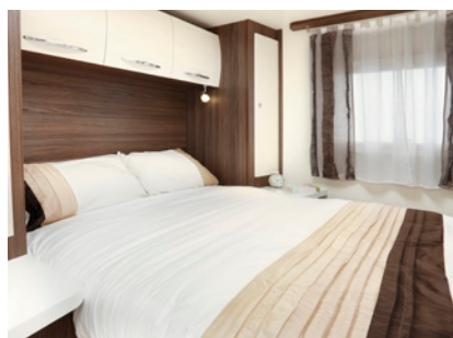
Mileo 294 Bedroom