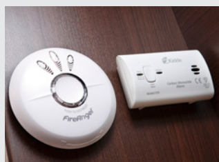
Smoke & carbon monoxide alarms