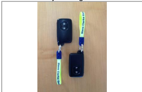
2 Keys - Image 1 of 1