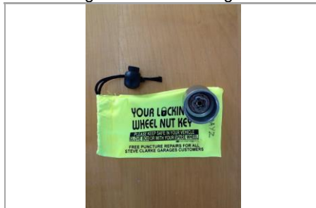
Locking Wheel Nut - Image 1 of 1