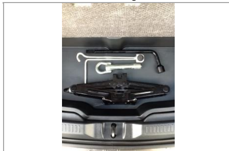
Tool Kit - Image 1 of 1