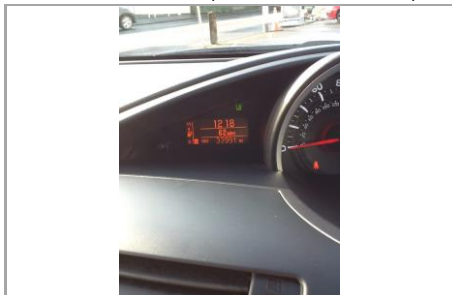
Vehicle has Fuel (20 miles minimum) -