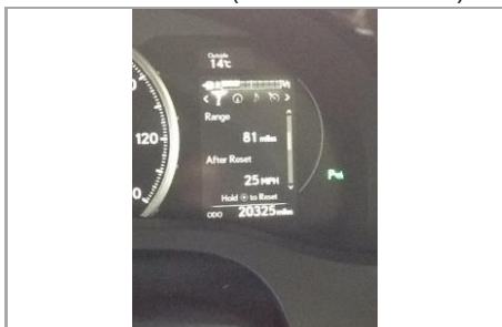
Vehicle has Fuel (20 miles minimum) -