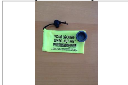
Locking Wheel Nut - Image 1 of 1