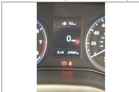
Vehicle has Fuel (20 miles minimum) -