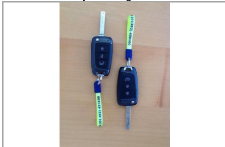
2 Keys - Image 1 of 1