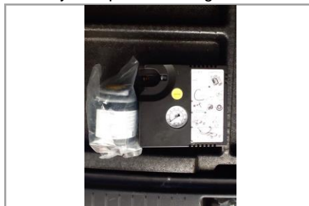
Tyre Repair Kit - Image 1 of 1