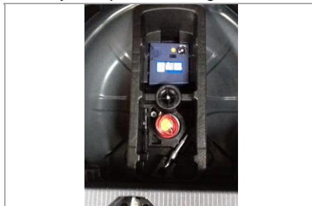
Tyre Repair Kit - Image 1 of 1