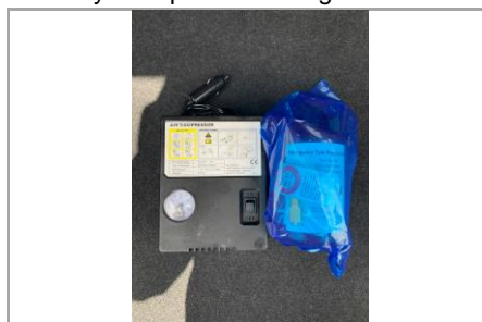
Tyre Repair Kit - Image 1 of 1