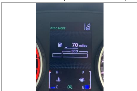
Vehicle has Fuel (20 miles minimum) -