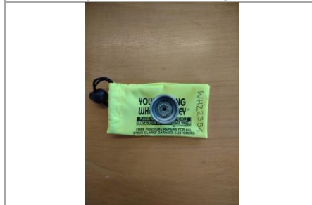
Locking Wheel Nut - Image 1 of 1