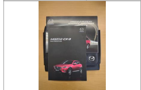
Handbook - Image 1 of 1