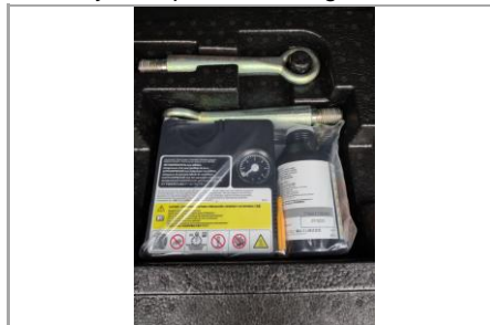
Tyre Repair Kit - Image 1 of 1