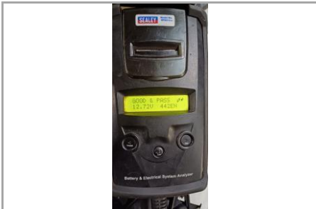
Battery State of Health - Image 1 of 1