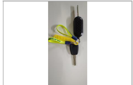
2 Keys - Image 1 of 1