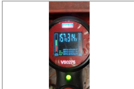
Brake Fluid Level - Image 1 of 1