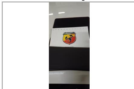
Handbook - Image 1 of 1