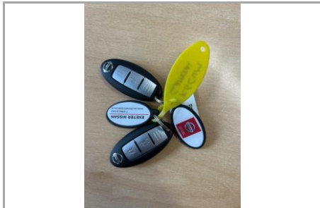
2 Keys - Image 1 of 1