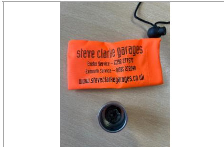
Locking Wheel Nut - Image 1 of 1