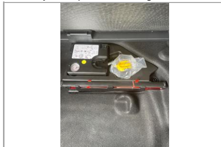
Tyre Repair Kit - Image 1 of 1