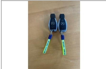
2 Keys - Image 1 of 1