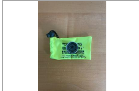
Locking Wheel Nut - Image 1 of 1