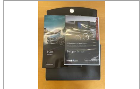
Handbook - Image 1 of 1