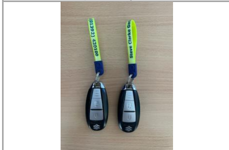
2 Keys - Image 1 of 1