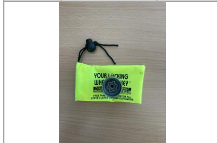
Locking Wheel Nut - Image 1 of 1