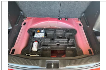
Tyre Repair Kit - Image 1 of 1