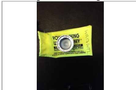
Locking Wheel Nut - Image 1 of 1