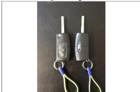
2 Keys - Image 1 of 1