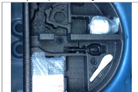
Tyre Repair Kit - Image 1 of 1