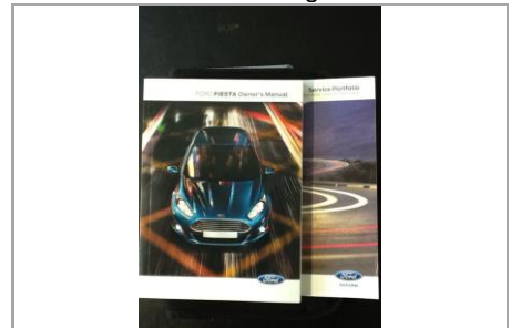
Handbook - Image 1 of 1