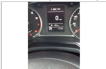
Vehicle has Fuel (20 miles minimum) -