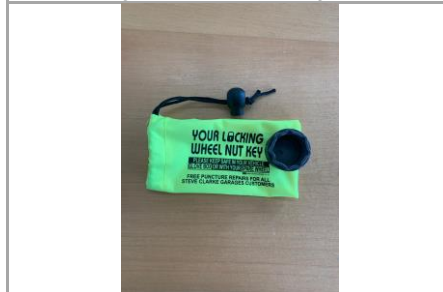
Locking Wheel Nut - Image 1 of 1