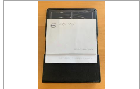
Handbook - Image 1 of 1