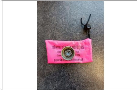
Locking Wheel Nut - Image 1 of 1