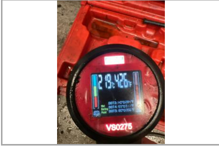
Brake Fluid Level - Image 1 of 1