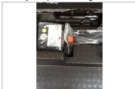
Tyre Repair Kit - Image 1 of 1