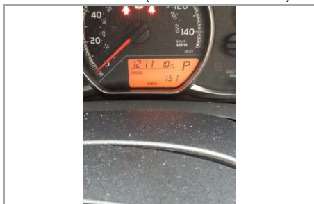
Vehicle has Fuel (20 miles minimum) -