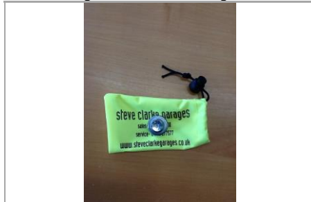
Locking Wheel Nut - Image 1 of 1