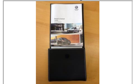
Handbook - Image 1 of 1