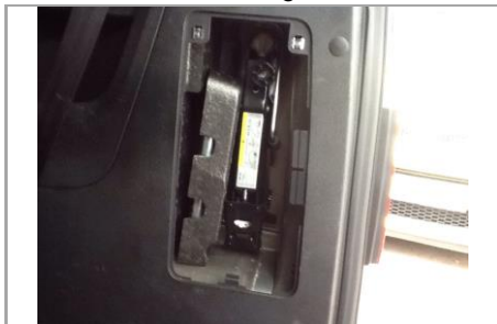
Tool Kit - Image 1 of 1