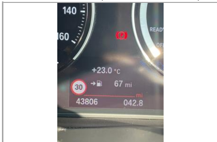
Vehicle has Fuel (20 miles minimum) -