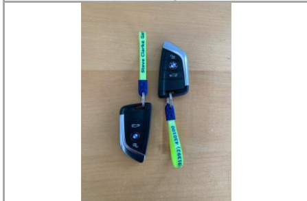
2 Keys - Image 1 of 1