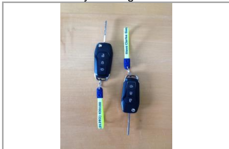
2 Keys - Image 1 of 1