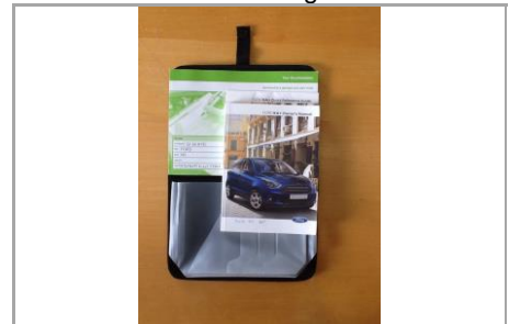
Handbook - Image 1 of 1