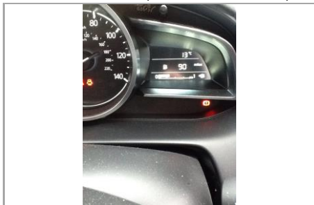
Vehicle has Fuel (20 miles minimum) -