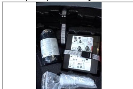
Tyre Repair Kit - Image 1 of 1