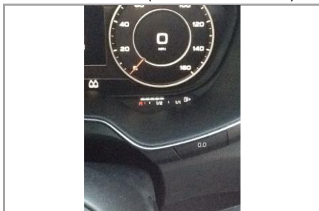
Vehicle has Fuel (20 miles minimum) -