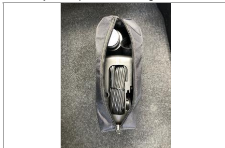
Tyre Repair Kit - Image 1 of 1