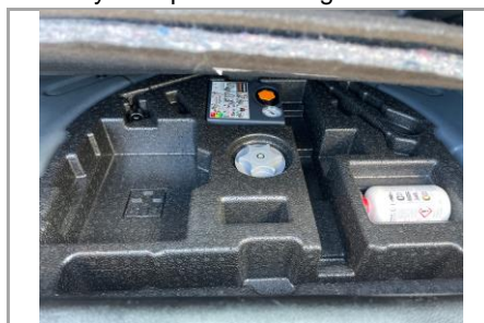
Tyre Repair Kit - Image 1 of 1