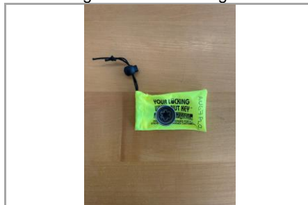
Locking Wheel Nut - Image 1 of 1