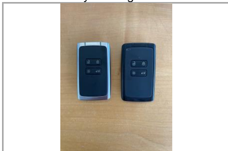
2 Keys - Image 1 of 1