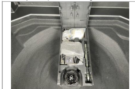
Tyre Repair Kit - Image 1 of 1