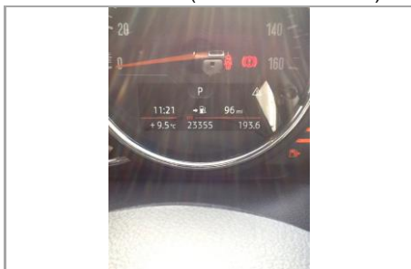
Vehicle has Fuel (20 miles minimum) -