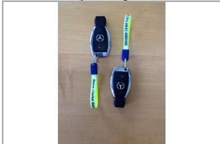
2 Keys - Image 1 of 1