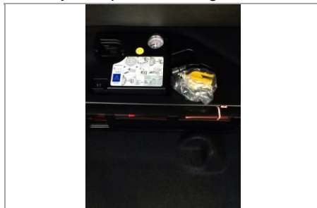
Tyre Repair Kit - Image 1 of 1