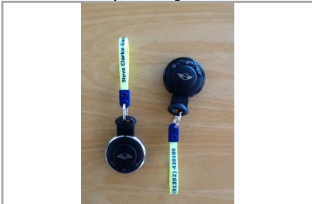
2 Keys - Image 1 of 1