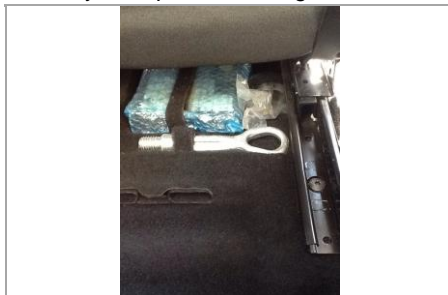
Tyre Repair Kit - Image 1 of 1