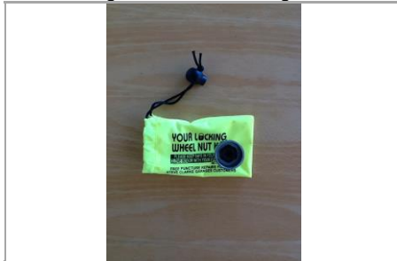
Locking Wheel Nut - Image 1 of 1