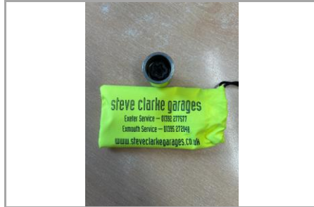
Locking Wheel Nut - Image 1 of 1