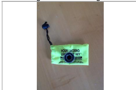
Locking Wheel Nut - Image 1 of 1