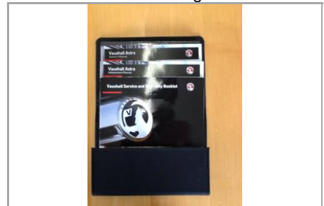
Handbook - Image 1 of 1