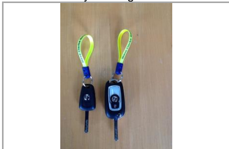
2 Keys - Image 1 of 1