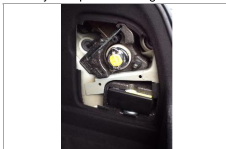
Tyre Repair Kit - Image 1 of 1