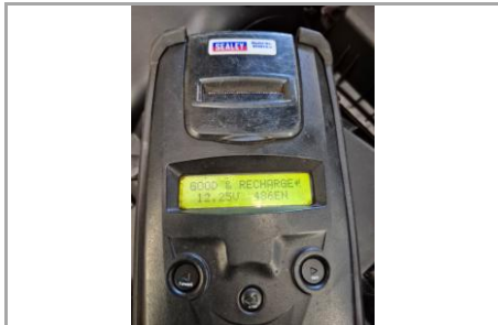
Battery State of Health - Image 1 of 1