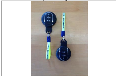
2 Keys - Image 1 of 1