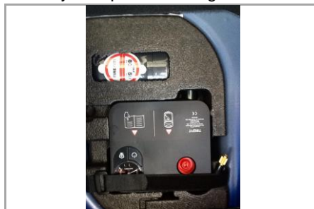
Tyre Repair Kit - Image 1 of 1