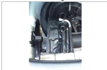
Tool Kit - Image 1 of 1