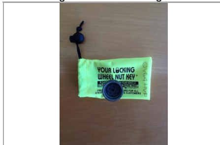
Locking Wheel Nut - Image 1 of 1