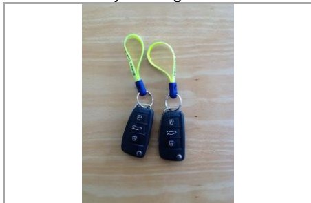
2 Keys - Image 1 of 1