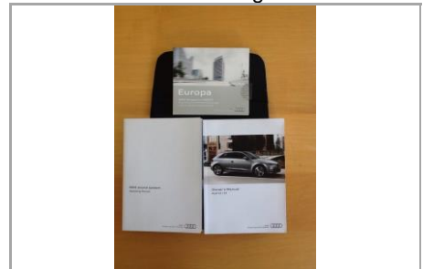
Handbook - Image 1 of 1