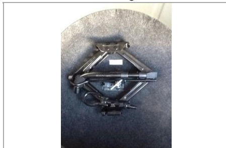
Tool Kit - Image 1 of 2