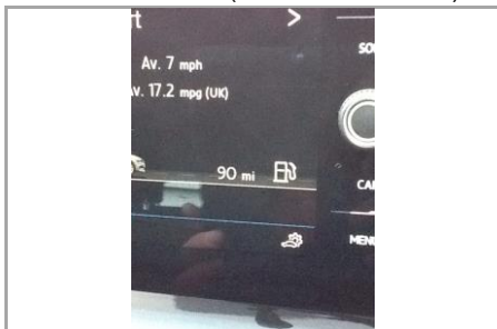
Vehicle has Fuel (20 miles minimum) -