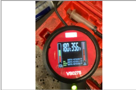
Brake Fluid Level - Image 1 of 1