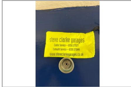
Locking Wheel Nut - Image 1 of 1