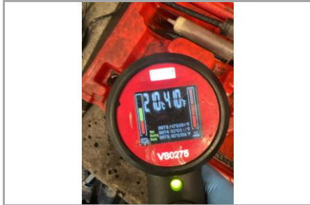
Brake Fluid Level - Image 1 of 1