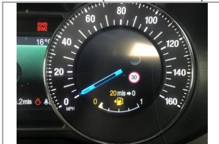
Vehicle has Fuel (20 miles minimum) -