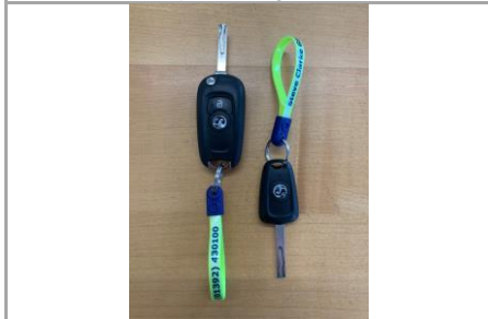
2 Keys - Image 1 of 1