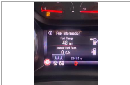
Vehicle has Fuel (20 miles minimum) -