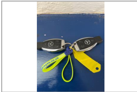
2 Keys - Image 1 of 1