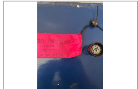
Locking Wheel Nut - Image 1 of 1