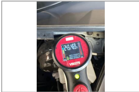
Brake Fluid Level - Image 1 of 1