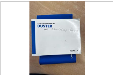
Handbook - Image 1 of 1