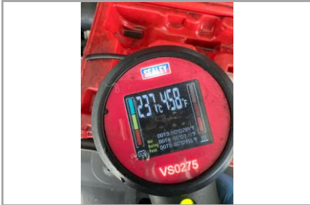
Brake Fluid Level - Image 1 of 1