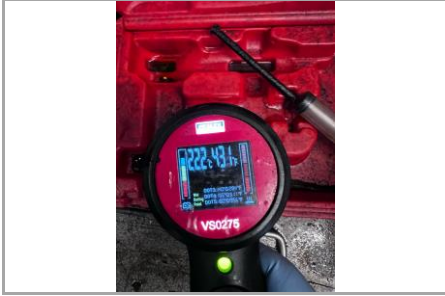
Brake Fluid Level - Image 1 of 1