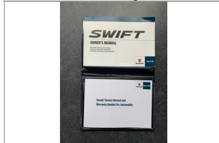
Handbook - Image 1 of 1