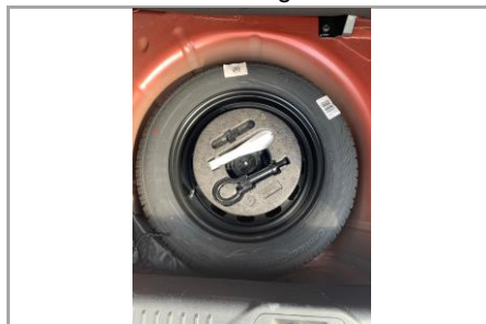
Tool Kit - Image 1 of 1