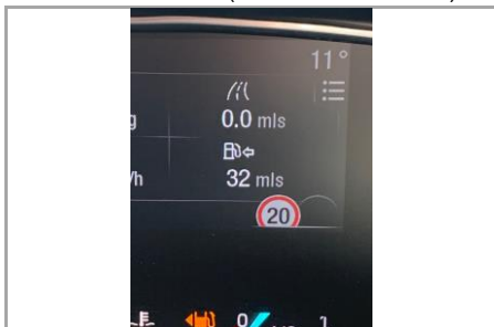
Vehicle has Fuel (20 miles minimum) -