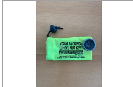
Locking Wheel Nut - Image 1 of 1