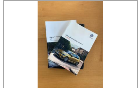
Handbook - Image 1 of 1