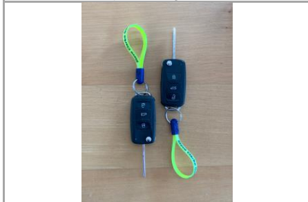
2 Keys - Image 1 of 1