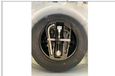
Tool Kit - Image 1 of 1