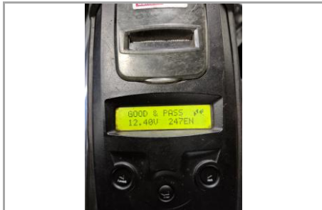
Battery State of Health - Image 1 of 1