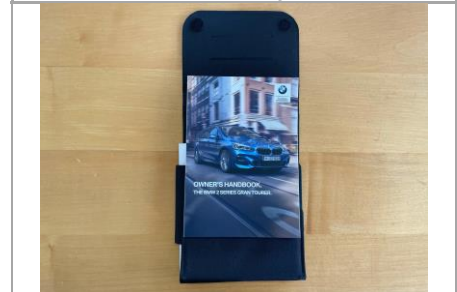
Handbook - Image 1 of 1