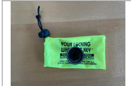
Locking Wheel Nut - Image 1 of 1