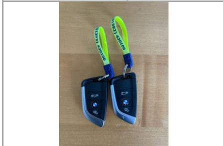
2 Keys - Image 1 of 1